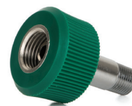
DISS Hand Tight Fitting