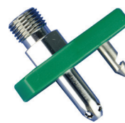
Chemtron Quick Connect