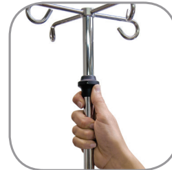
Adjust Pole Quickly w/ Ease