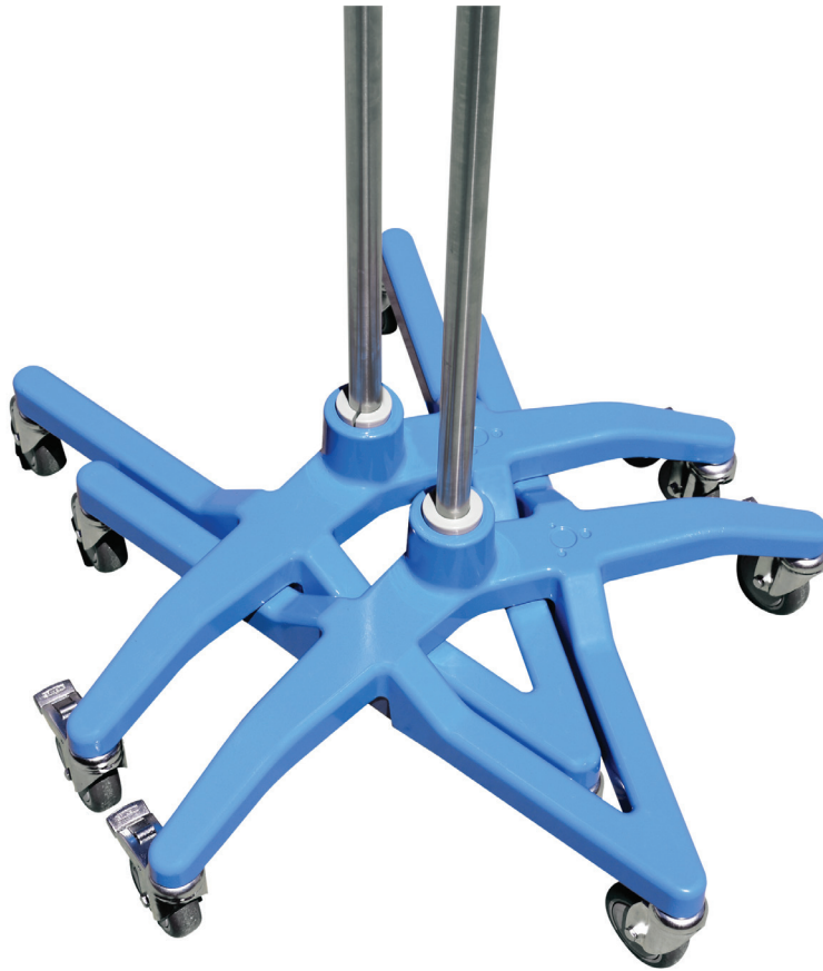
24" Wide Base Design Leaves Wider Footprint for Added Applications

"Designed for ultimate efficiency & durability"