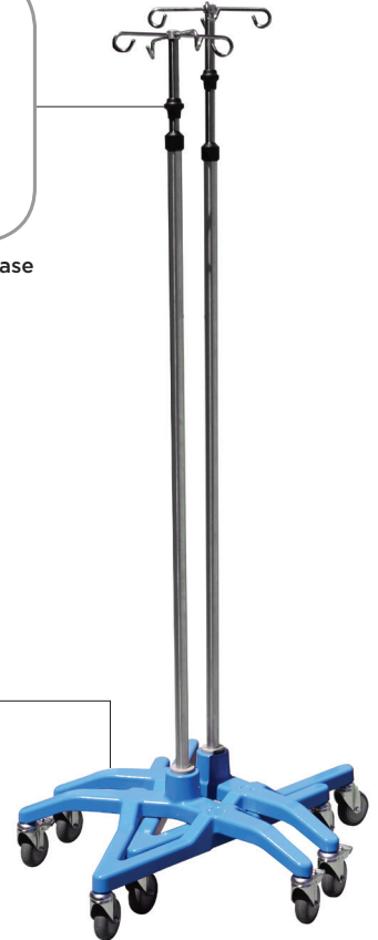
Sturdy Base for Added Stability & Durability