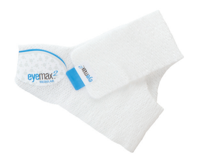
REGULAR (12.6"-14.9") (Occipital Frontal Circumference)