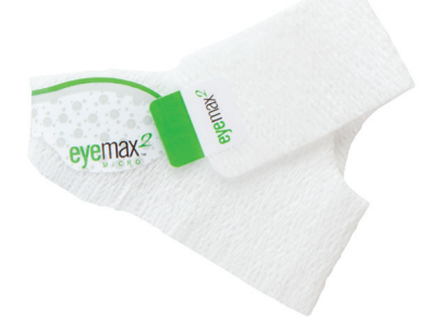
MICRO (7.87"-10.4") (Occipital Frontal Circumference)