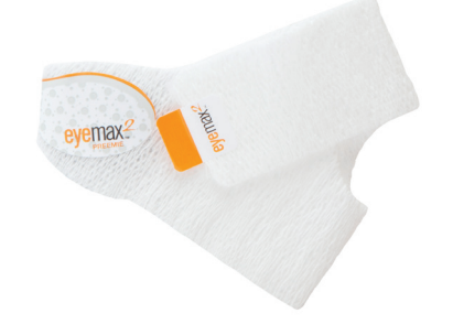
PREEMIE (10.4"-12.6") (Occipital Frontal Circumference)