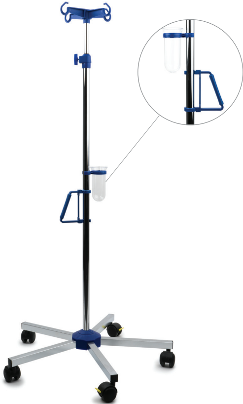
Regular I.V. Pole