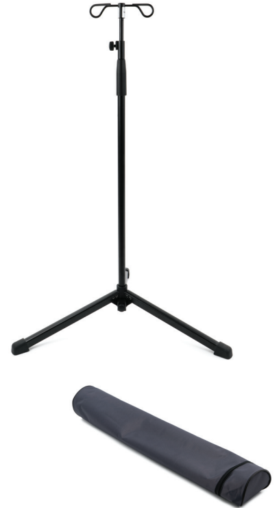
Folding I.V. Pole With Bag